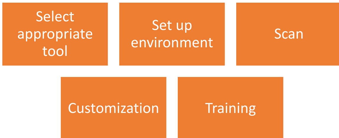
Figure 1 Stages of implementation process of SAST.

Following are the stages of the implementation process of the SAST technique: -