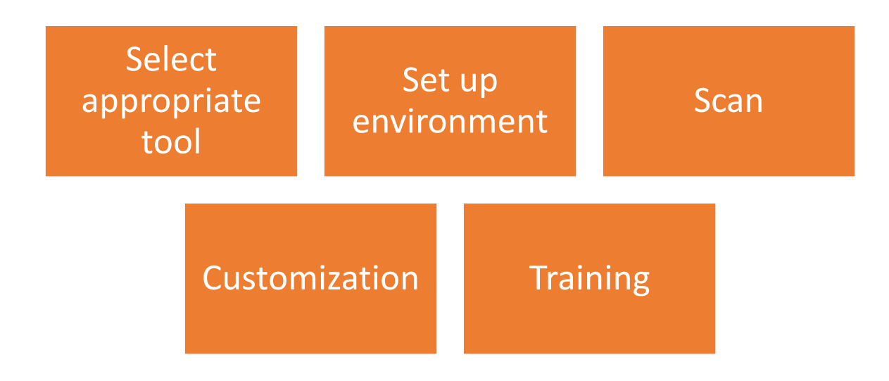
Figure 1 Stages of implementation process of SAST.

Following are the stages of the implementation process of the SAST technique: -