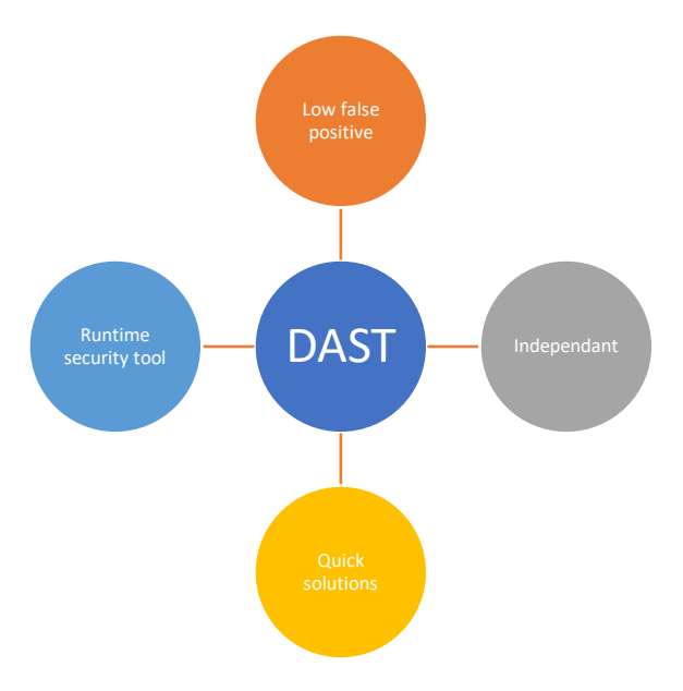
Figure 2. Advantages of DAST.